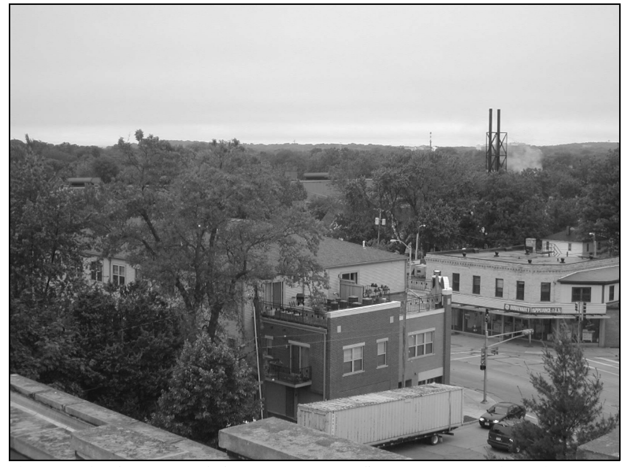
Figure 1 - View from the Roof of Lowell Elementary School towards Madison-Kipp

Besides discharges from Madison-Kipp Corporation, located one block to the west, the school and nearby student homes are located along Atwood Avenue and East Washington Avenue, significant transportation corridors in Madison, and the flight path of the main runway at the Dane County Regional Airport.